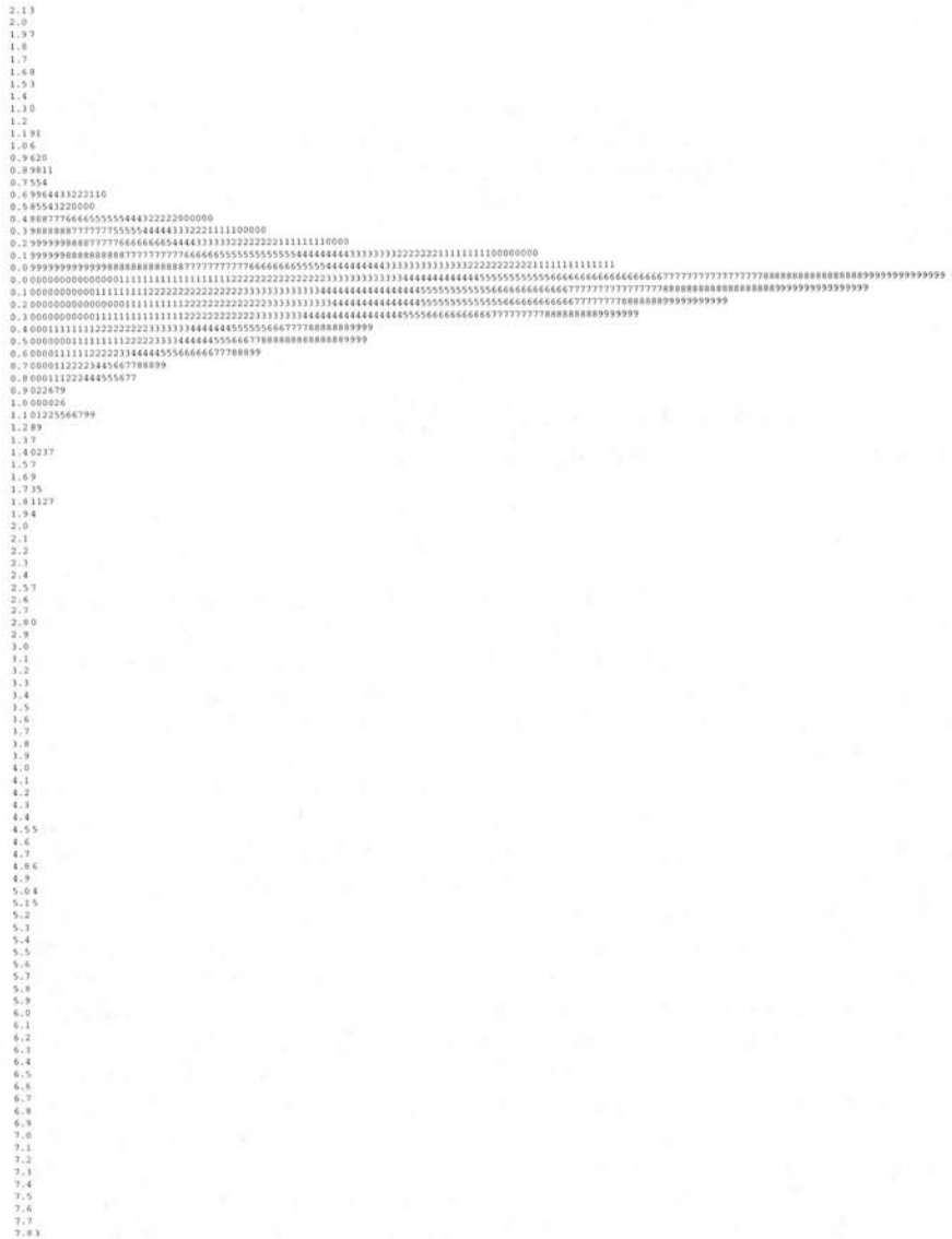
FIGURE 1. Stem and leaf plot of CSR effect sizes (n = 1,111 observations).